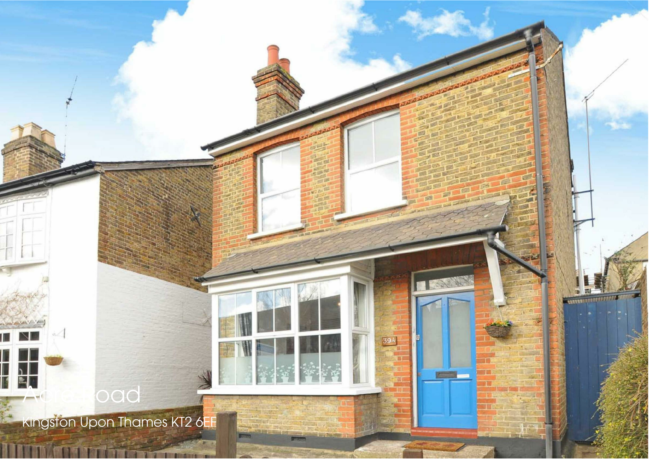
Acre Road Kingston Upon Thames KT2 6EE